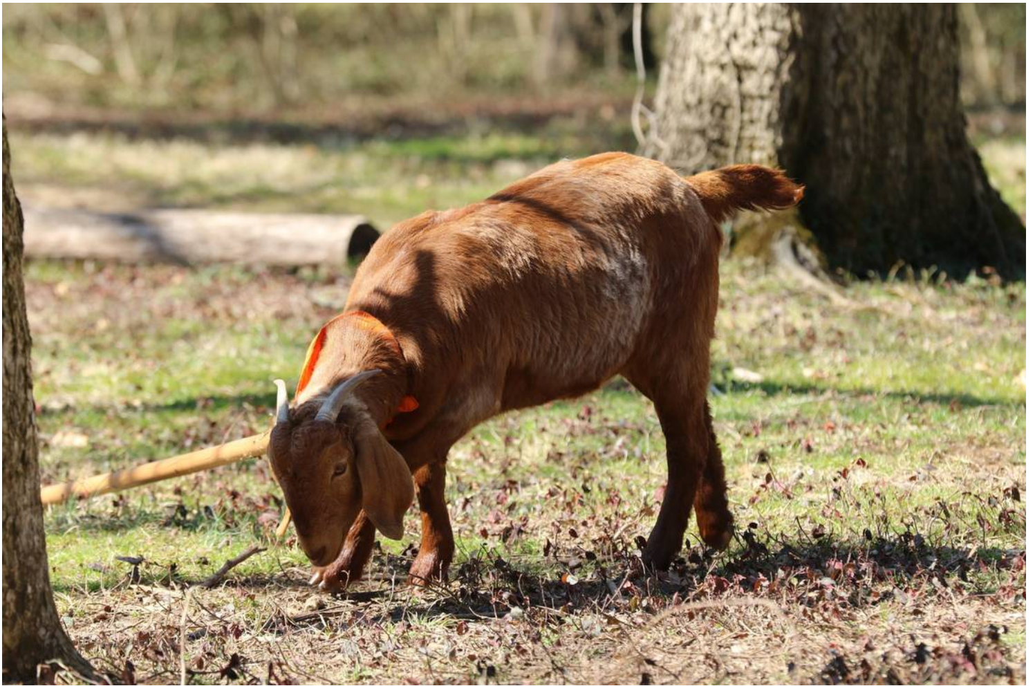
With her solid red coat, "Lucy" is named for Lucille Ball.